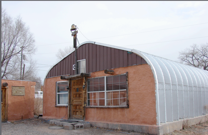
Community Outreach Center

A PROPOSAL TO: RENOVATE THE COMMUNITY OUTREACH BUILDING, ADD A SUSTAINABLE COMMUNITY GREENHOUSE AND PROVIDE IMPROVEMENTS TO THE EXISTING GROUNDS AND PARKING AREA.